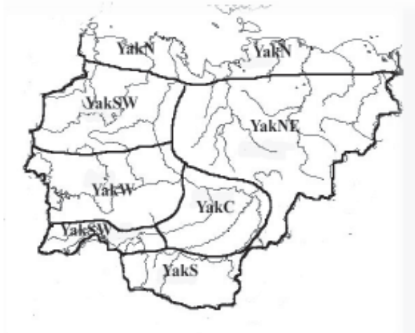
Fig. 2. Parts of Yakutia.

R.), Nov (Novosibirsk – SZM), RAI (Teletskoe Lake; Uznezya on the Katun' R.).